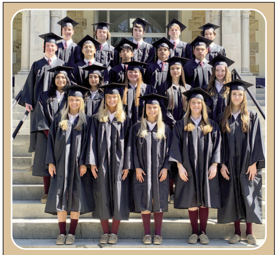
St. Bernard Preparatory School Class of 2023