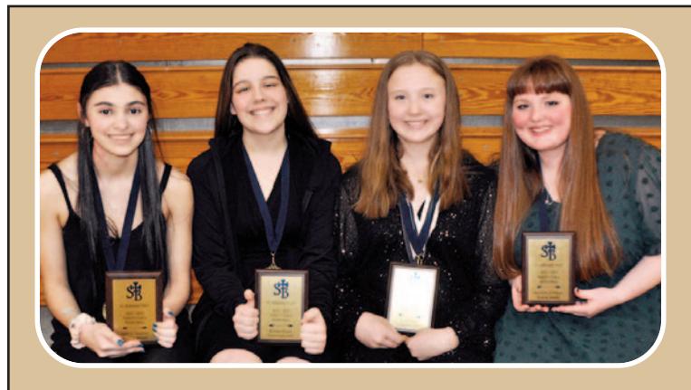
Girls Basketball Awards