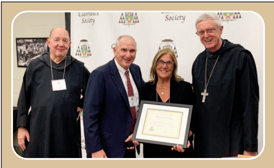
New Clairvaux Society Members