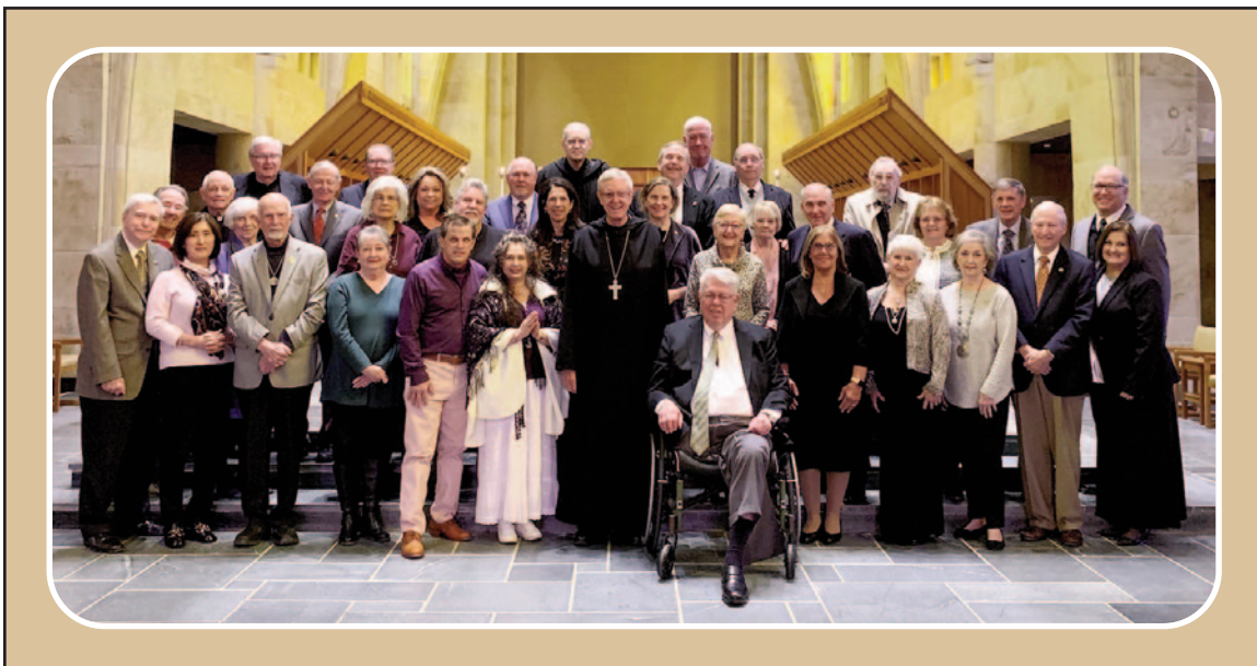
2023 Clairvaux Society