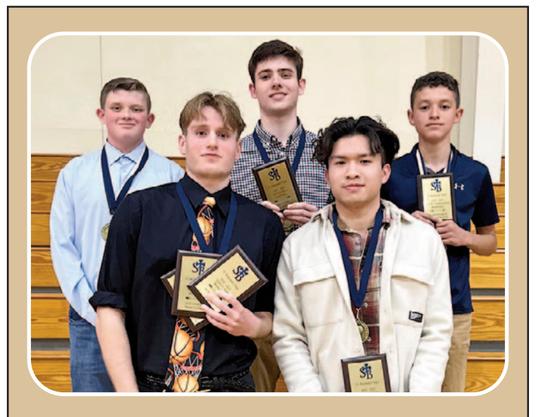
Boys Basketball Awards