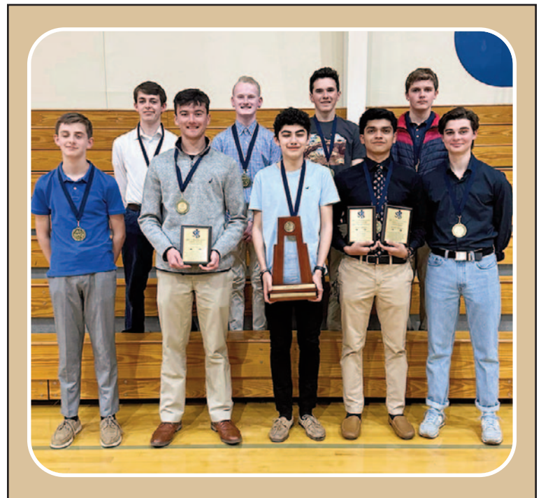
Boys Cross Country Awards