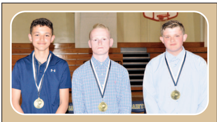
JV Basketball Awards