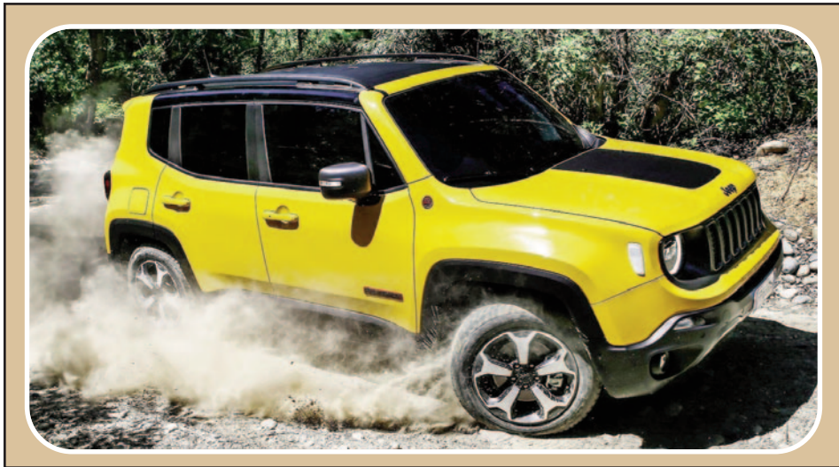
Bloomin' Festival Grand Prize - 2023 Jeep Renegade