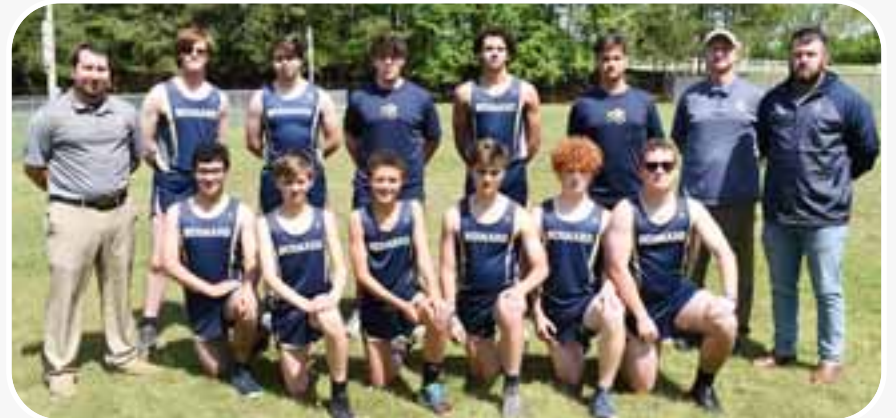
Boys Track and Field