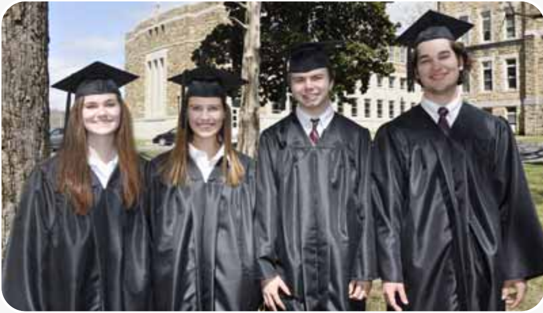
Senior Class Officers