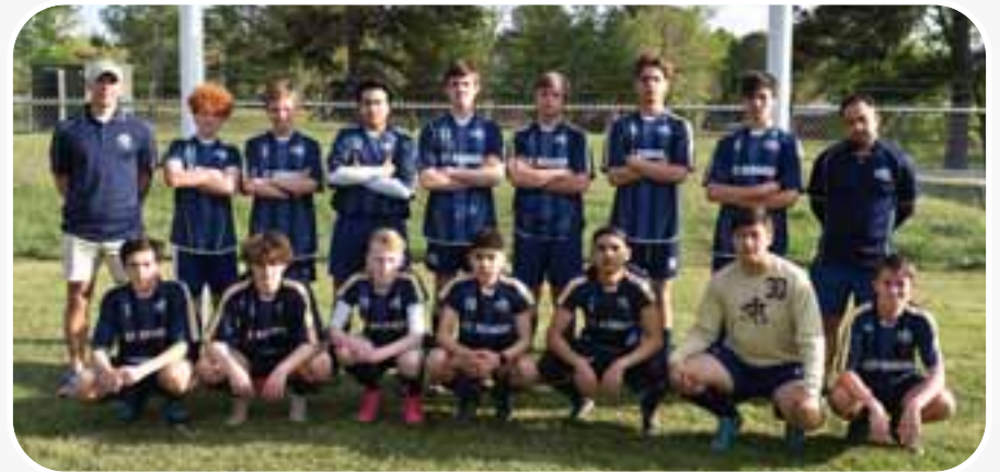
Boys JV Soccer