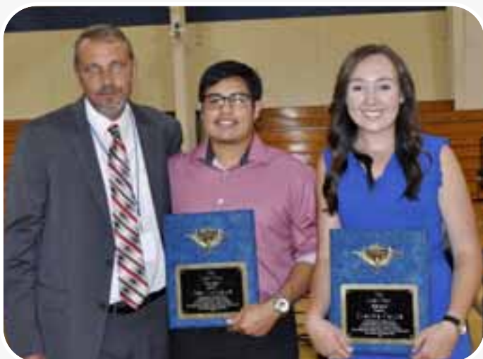
Fazi Award Winners

To learn more about the Development and Alumni Office's work, contact Hooper at (256) 255-5857 or thooper@stbernardprep.com . Visit donate.onecause.com/sbpgivingday to learn more about Giving Day 2022 and view our donor wall.