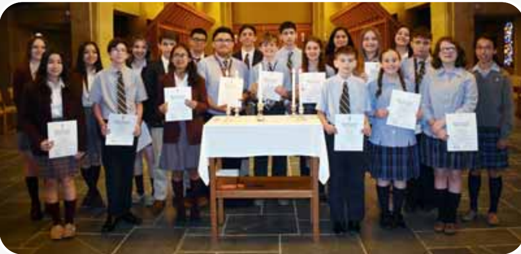
New National Junior Honor Society Members