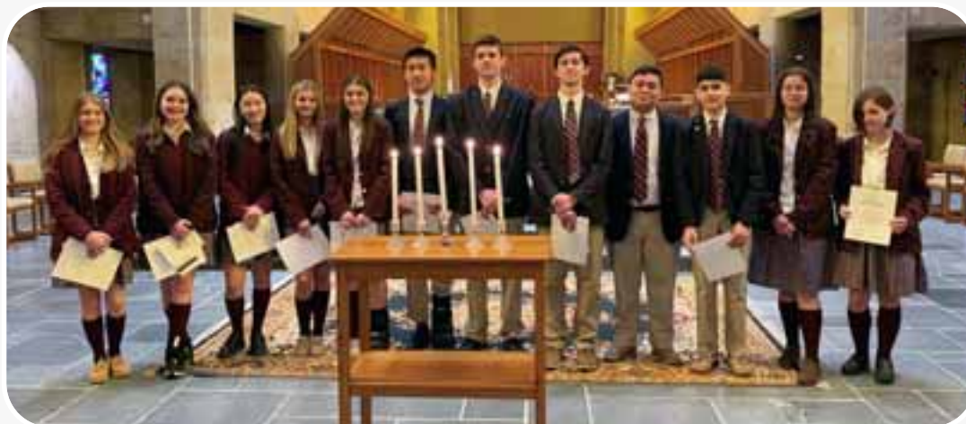
New St. Bernard National Honor Society Members