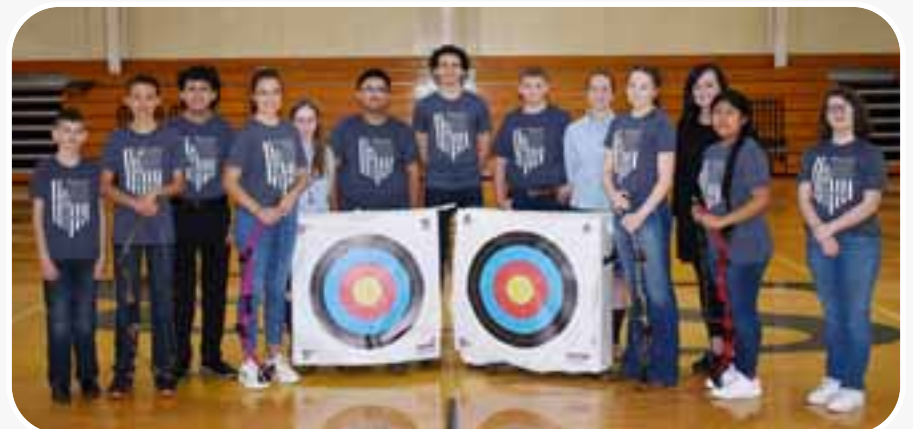
Middle School Archery