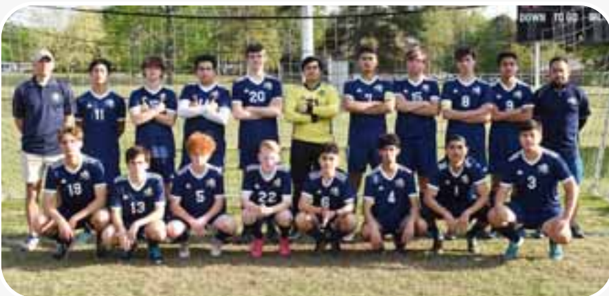
Boys Varsity Soccer