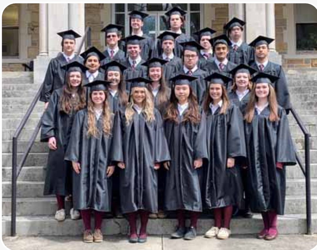
St. Bernard Class of 2022