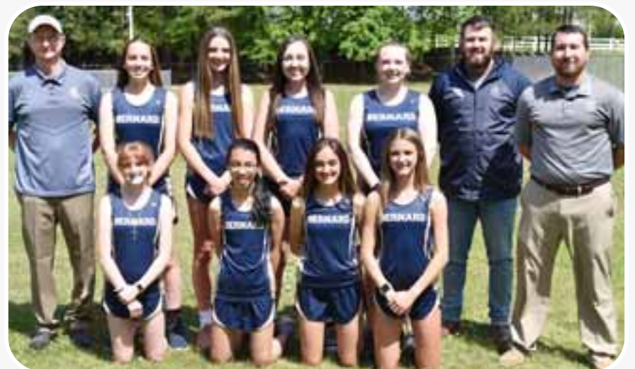
Girls Track and Field