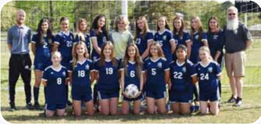
Girls Varsity Soccer