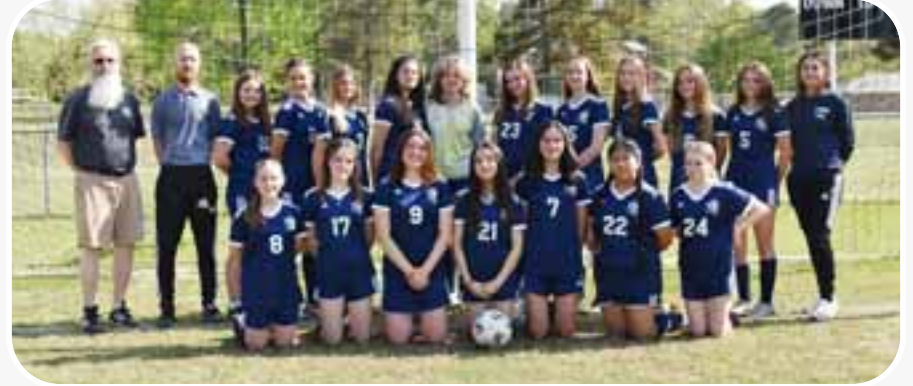
Girls JV Soccer