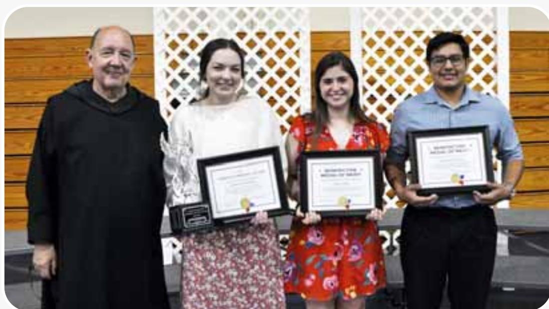
Christian Service Award and Benedictine Medal of Merit