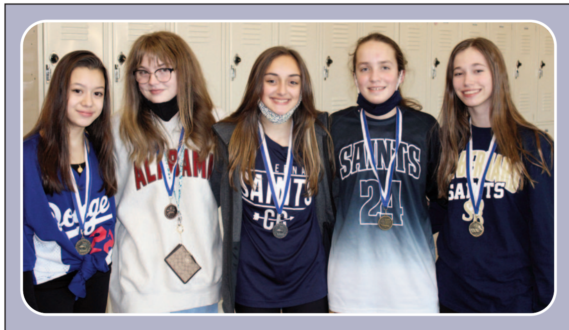
St. Bernard Bee Winners