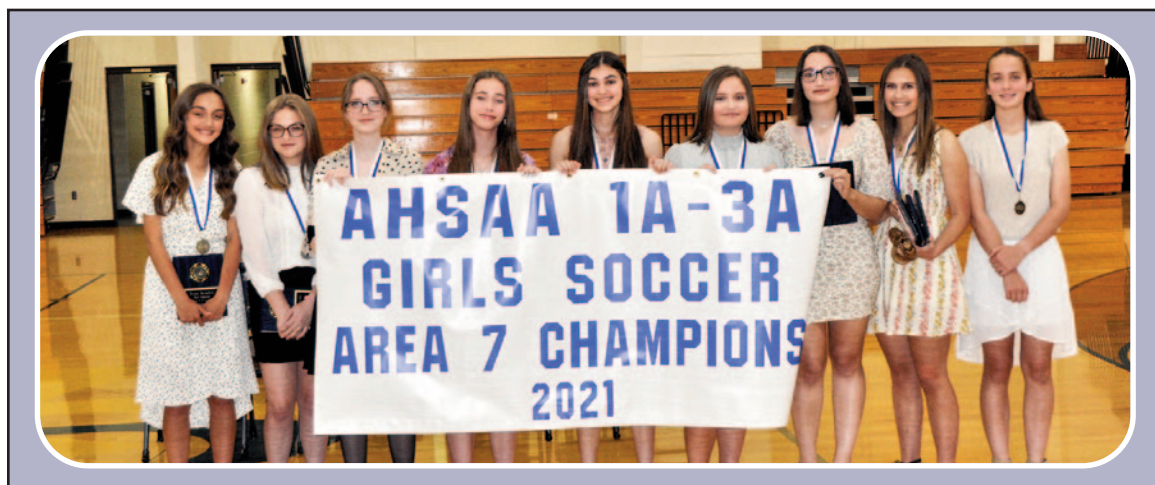
Area 7 Champions