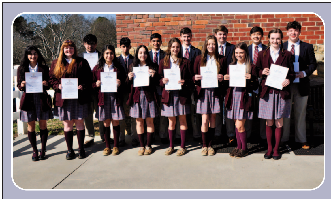
Honor Society Members

Immediately following the ceremony, students and parents enjoyed a nice reception.