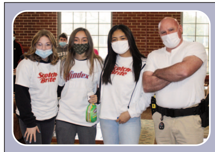
Mr. Clean Character Day