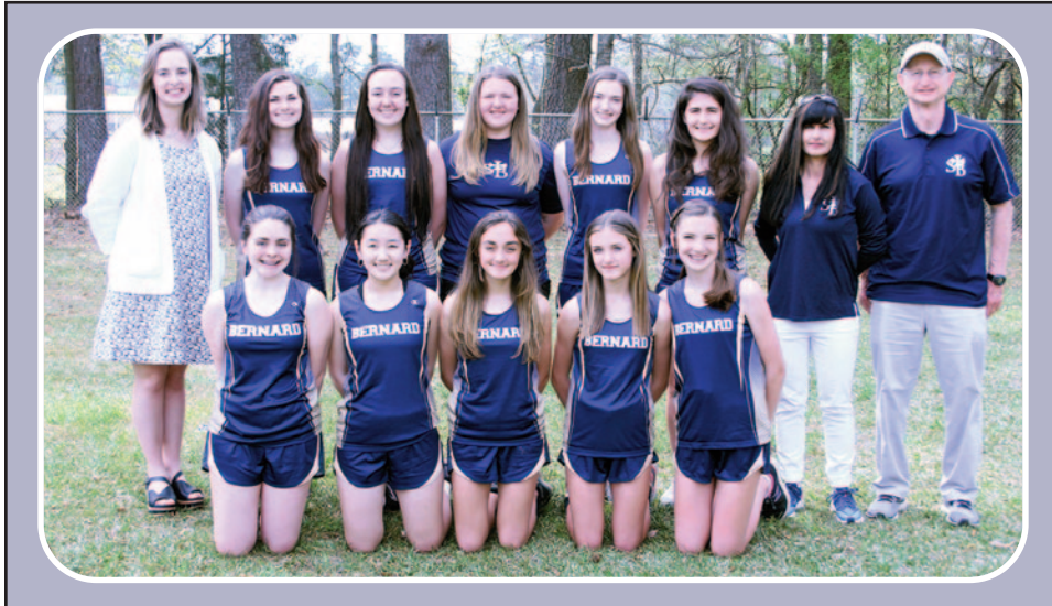
Girls Track Team