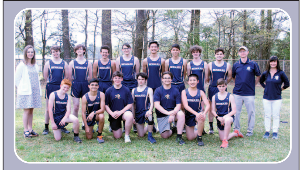
Boys Track Team