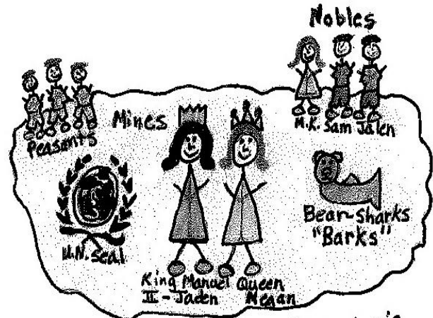
The Kingdom of Mannotopia